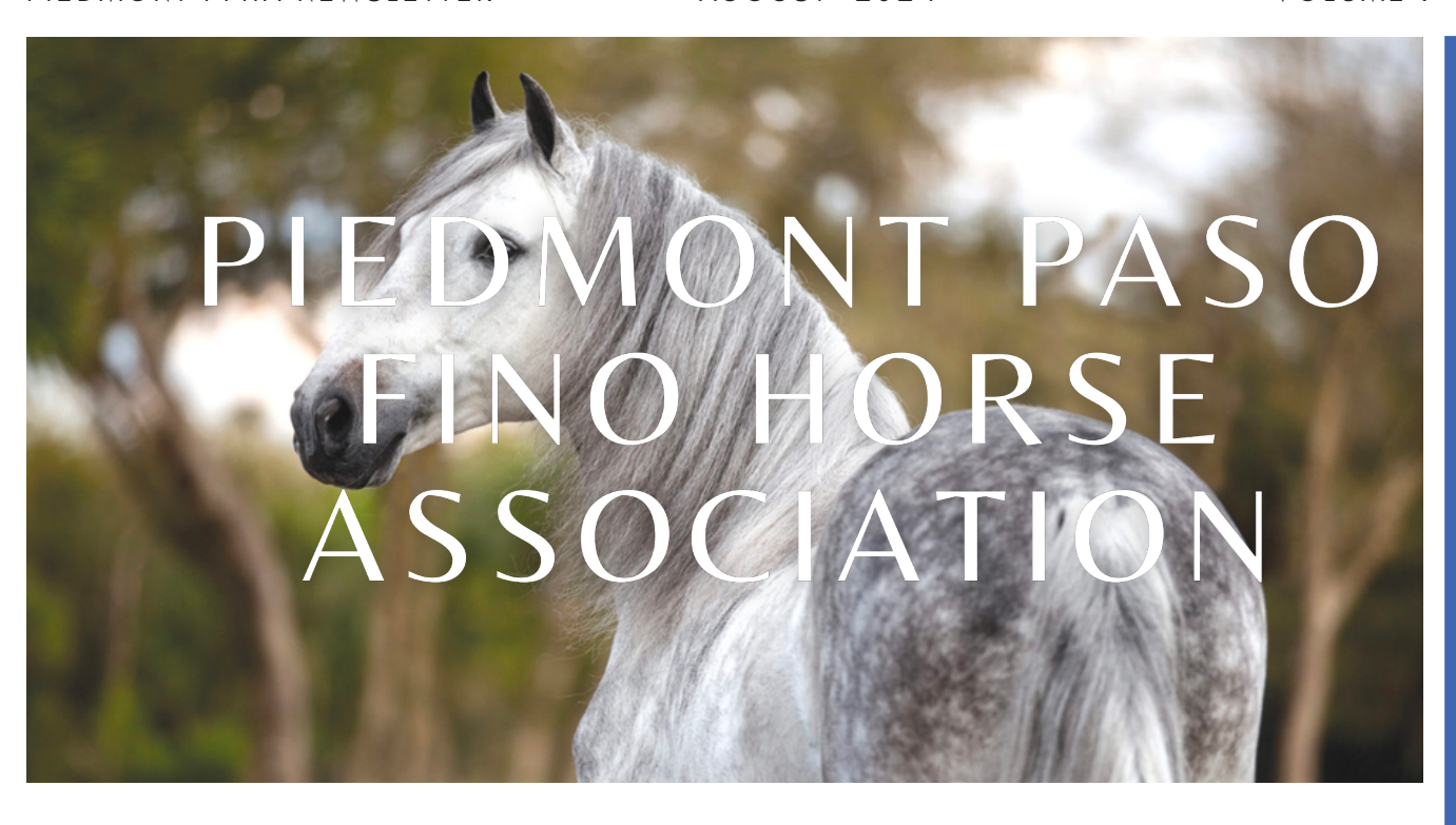
This Fall we are looking forward to adding a new event to our Piedmont PFHA calendar.